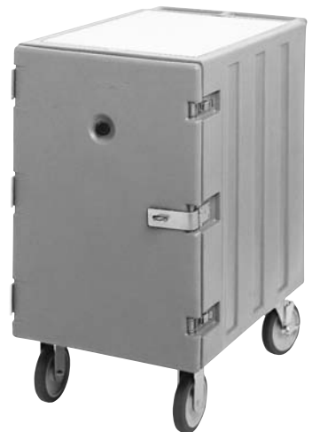
1826LBCSP (With Security Package)