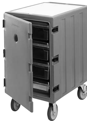
1826LBC (For Food Storage Boxes)