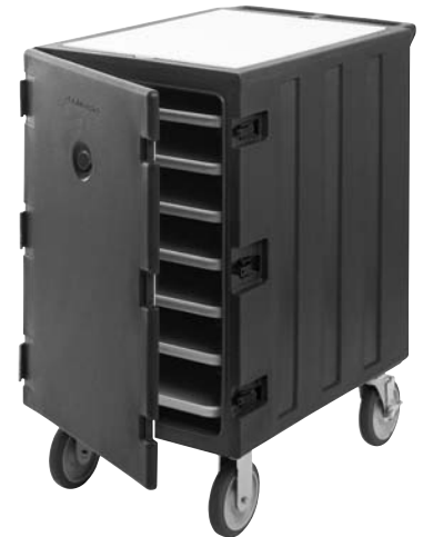
1826LTC3 (For Trays & Sheet Pans)