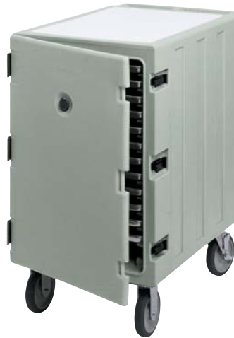
1826LTC (For Trays & Sheet Pans)